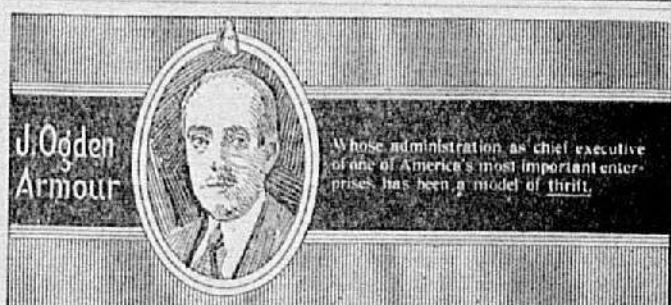
J. Ogden Armour

Whose administration as chief executive of one of America's most important enter- prises has been a model of thrift.